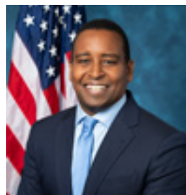
Joe Neguse Colorado