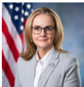
Madeleine Dean Pennsylvania