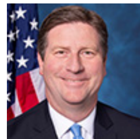
Greg Stanton Arizona