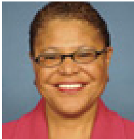
Karen Bass California