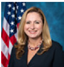
Debbie Mucarsel-Powell Florida