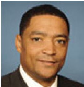
Cedric L. Richmond Louisiana