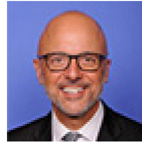
Theodore E. Deutch Florida