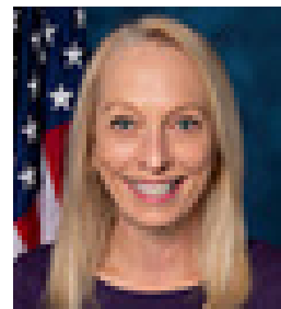
Jerrold Nadler New York

As the top Democrat on the House Judiciary Committee goes all out in his investigation of President Donald Trump’s ties to Russian interests, one of his campaign consultants is working on behalf of a prominent employee of Russia’s foreign-propaganda apparatus.