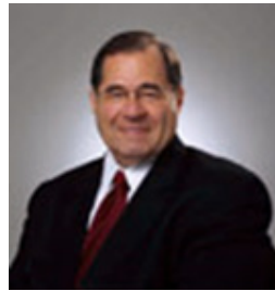
Jerrold Nadler New York