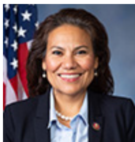
Veronica Escobar Texas