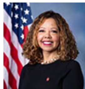
Lucy McBath Georgia