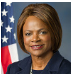
Val Butler Demings Florida