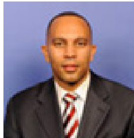
Hakeem S. Jeffries New York