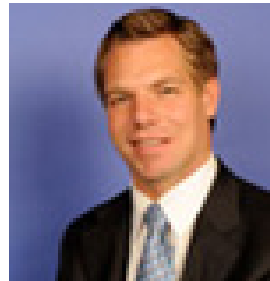
Eric Swalwell California