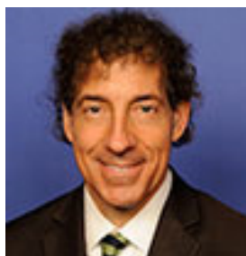
Jamie Raskin Maryland