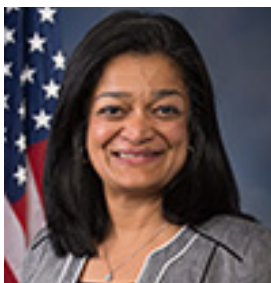
Pramila Jayapal Washington