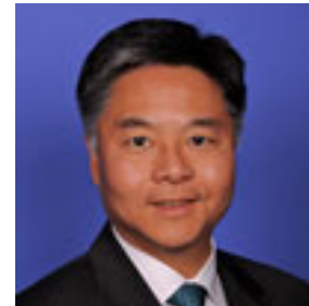
Ted Lieu California