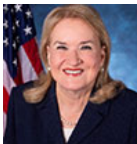
Sylvia R. Garcia Texas