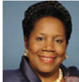
Sheila Jackson Lee Texas