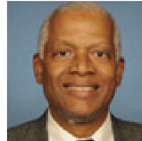
Henry C. "Hank" Johnson Georgia